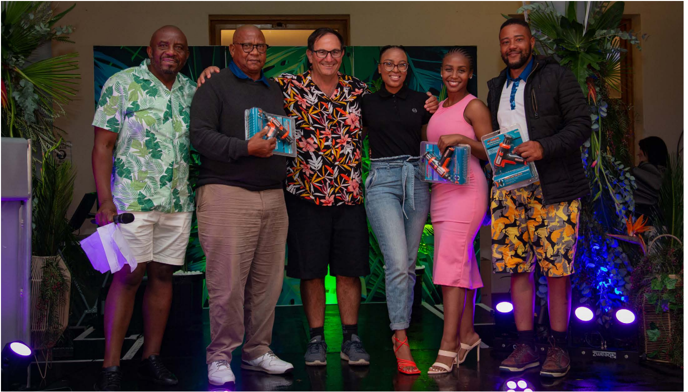
A group of winners at MaxProf's Annual Golf Day, during the evening function at Pretoria Country Club