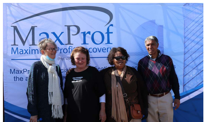
The Board of Directors of the Lodewyk Spies Old Age Home and a representative of The Firends of the Needy Fund