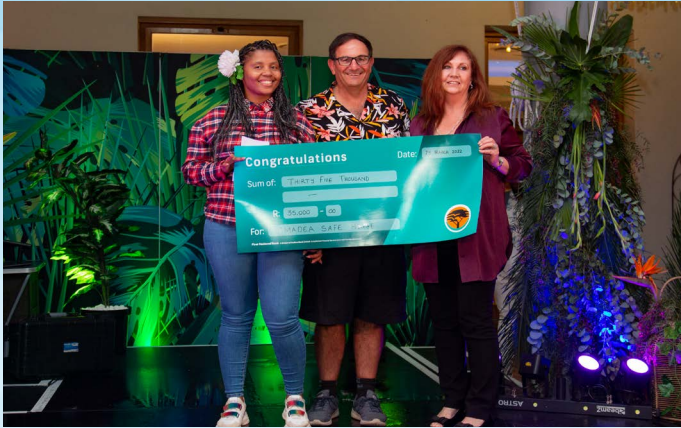
A representative from Amadea Safe House receives the generous donation during the evening function at Pretoria Country Club

MaxProf hosted its Annual Charity Golf Day on 25 March at the Pretoria Country Club in Waterkloof, Pretoria (Gauteng). Preparations for the day are always a demanding exercise but the results are worth it. This year's theme was Tropical Paradise, and we ensured that every part of the event encompassed the luscious greenery of an island in the summer; from the invitation to the drinks, the tiki golf stands, entertaining belly dancers and flame throwers.