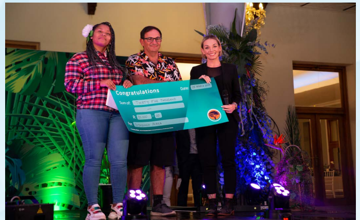
Siyabonga Africa receiving their cheque at MaxProf's Annual Golf Day