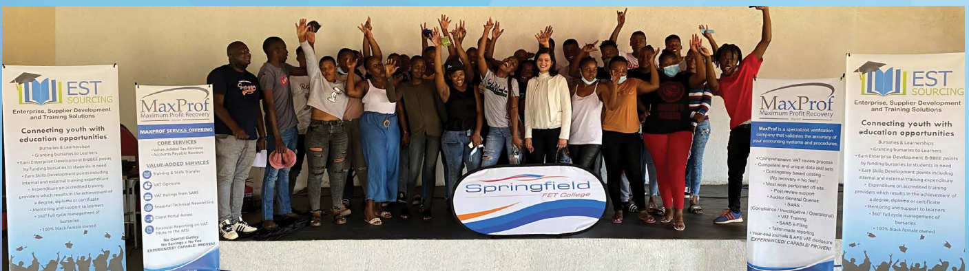
Students from Springfield College are proud recipients of bursaries from MaxProf and EST Sourcing

the Mogalakwena Local Municipality received bursaries, respectively. The students that were placed from the beginning of the year, are still being supported and mentored according to their individual needs. Students studying remotely are still receiving mobile data monthly to ensure undisrupted education no matter where they are.